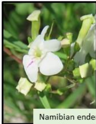
Namibian endemic, Manuleopsis dinteri