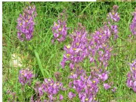
Right: The secretive, semi-aquatic Craterostigma plantagineum was found hiding among Nerine lilies on a stream bank