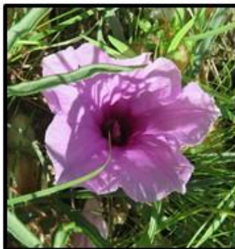
Above: Wild morning glory, Ipomoea bolusiana . Left: Solanum capense Right: Commelina livingstonii