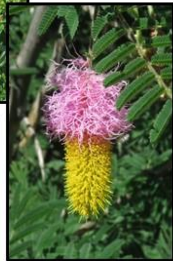
Kalahari Christmas tree ( Dichrostachys cinerea ) needs no introduction