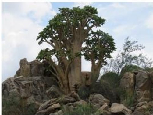
Cyphostemma curreri (Kobas, Butterbaum) on the D1958 south-west of Okahandja.