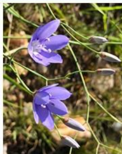
Left: Lapeirousia avasmontana, endemic to the hills in the Khomas Highlands Right: Hibiscus sp. Below centre: The shy Hermannia modesta