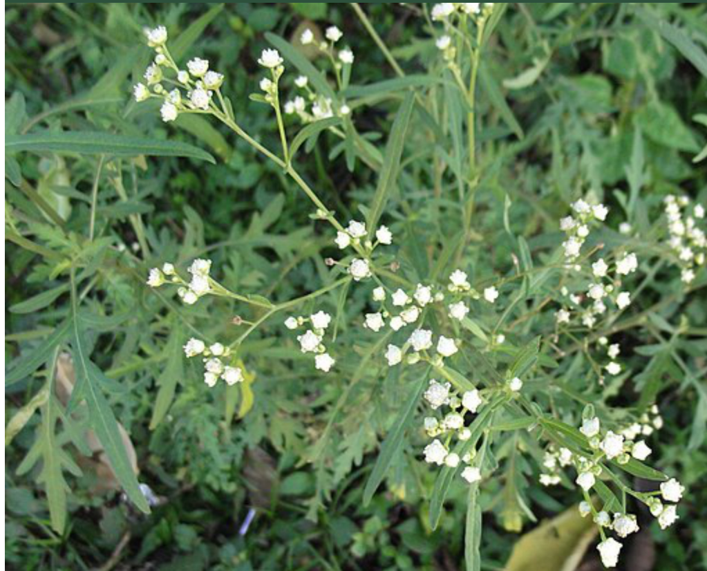
Famine Weed, Feverfew, Demoinabossie